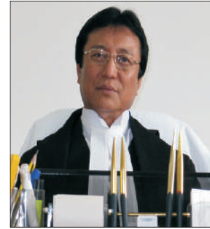
Hon'ble Mr. Justice S.P. Wangdi Judge