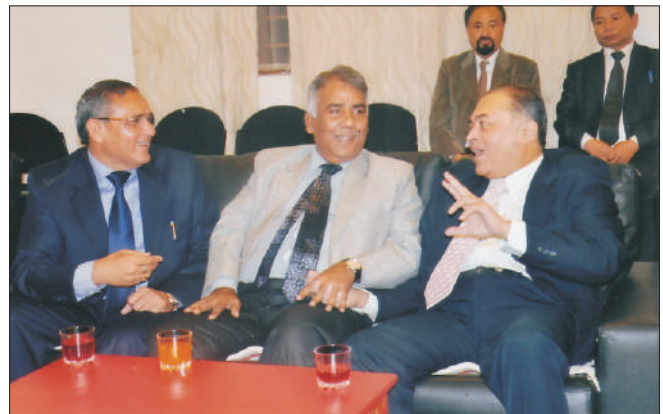
Glimpses of the Dinner hosted in honour of Hon'ble Mr. Justice C.K. Prasad, Judge, Supreme Court of India