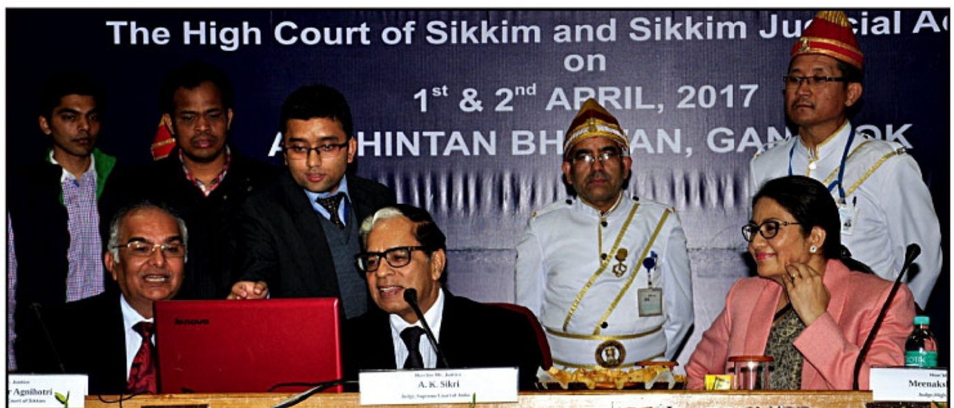
The launching of CIS for High Courts during the function at Chintan Bhawan.