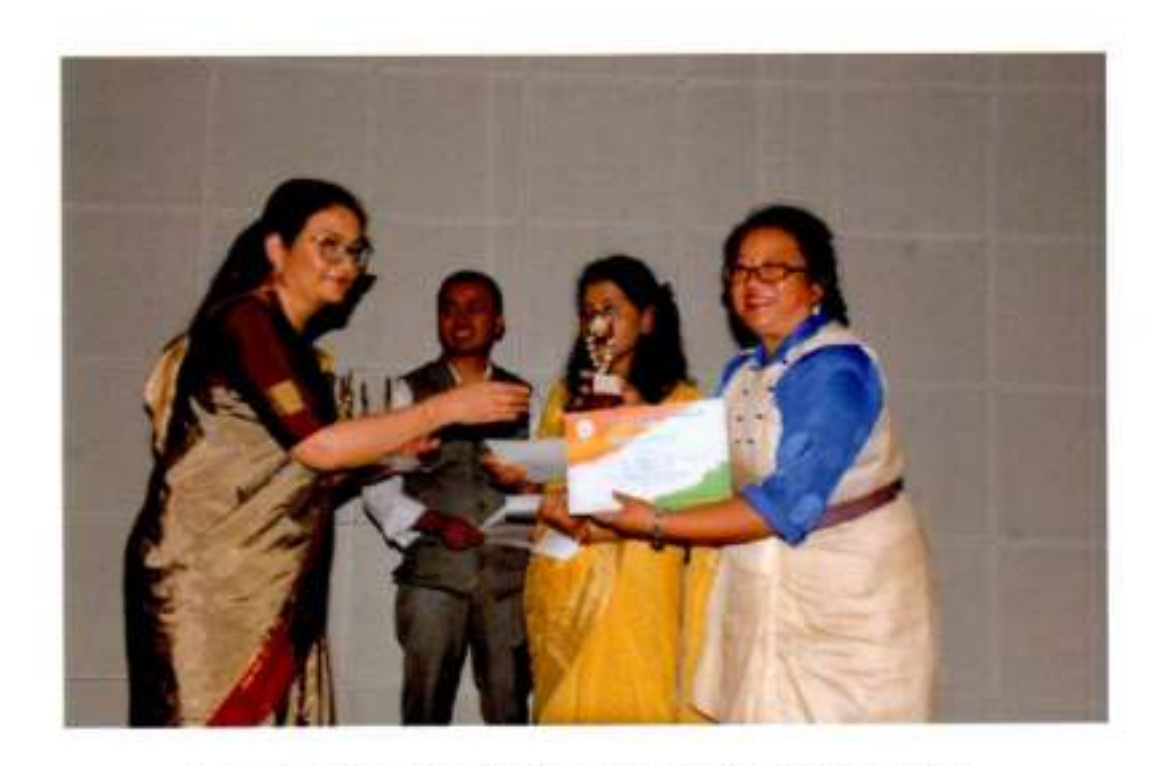
Participant being awarded by Hon'ble the Acting Chief Justice