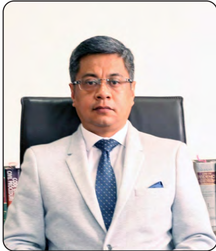
HON'BLE SRI JUSTICE BHASKAR RAJ PRADHAN JUDGE, HIGH COURT OF SIKKIM