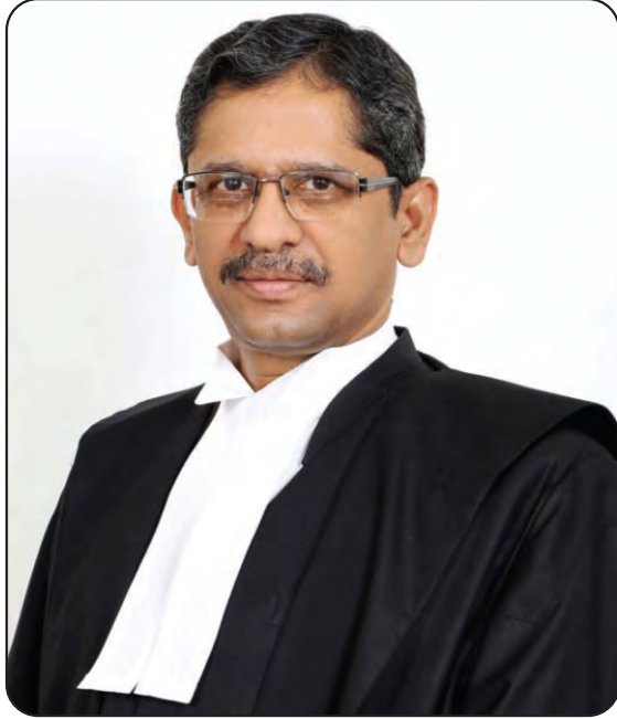
HON'BLE SRI JUSTICE N.V. RAMANA JUDGE, SUPREME COURT OF INDIA