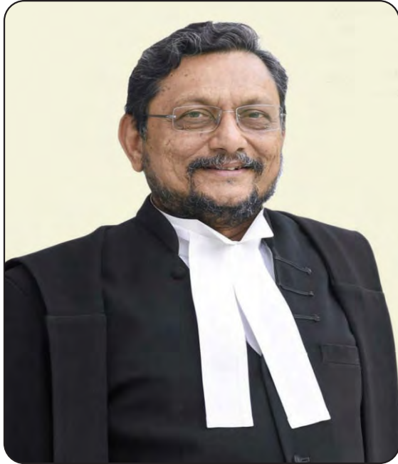
HON'BLE SRI JUSTICE S.A. BOBDE CHIEF JUSTICE OF INDIA